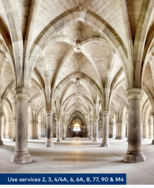
Use services 2, 3, 4/4A, 6, 6A, 8, 77, 90 & M4

The Glasgow Distillery Co. The Scottish Whisky Distillery of the Year 2020, it was opened in 2014 inspired by The Glasgow Distillery Company which first opened way back in 1770. Take a tour of the distillery, sample a range of tantalising whiskies and even buy one for your trip home.