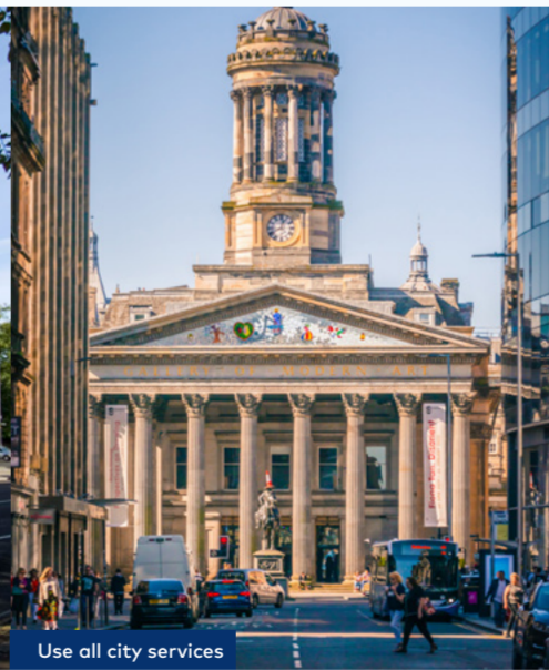
Use all city services

St. Mungo Museum of Religious Life & Art The museum is named after Glasgow's patron saint and is full of stunning works of art, exploring the importance of religion in lives across the world and across time. Aiming to promote understanding and respect between people of different faiths and those of none, they host regular events; from family-friendly activities to talks about culture and religion in Scotland today. Network tickets also available.