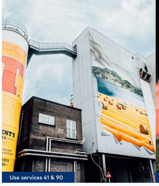
Use services 41 & 90

Alan McDougall, Glasgow Concierge Alan recommends Mackintosh House at the Hunterian. "It's a must-see for all Mackintosh fans coming to Glasgow." The Loveable Rogue: "Fantastic seasonal food and local hospitality." The Pot Still: "A perfect example of Glasgow hospitality. A great honest wee pub. More whiskies than you can shake a stick at."