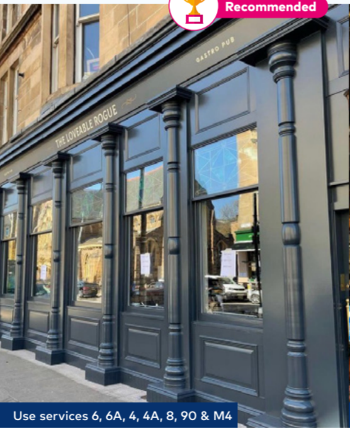
Use services 6, 6A, 4, 4A, 8, 90 & M4

Mackintosh House & The Hunterian The home of Scottish architect, designer and artist, Charles Rennie Mackintosh and his wife, the artist Margaret Macdonald is meticulously recreated for a step back in time. While The Hunterian houses one of the most important collections of their work.