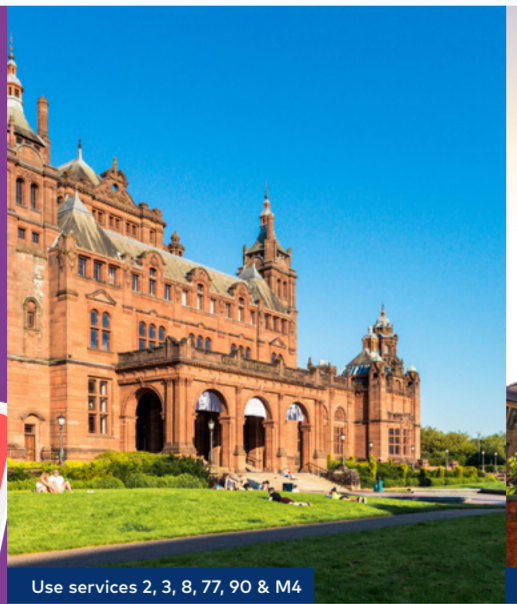
Use services 2, 3, 8, 77, 90 & M4

Kelvingrove Art Gallery & Museum This is one of Scotland's most popular free attractions and displays an awe inspiring 8000 objects, across some 22 modern galleries. From natural history, to arms and armour, there really is something of interest for everyone here.