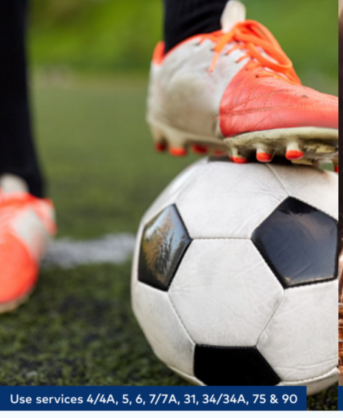
Use services 4/4A, 5, 6, 7/7A, 31, 34/34A, 75 & 90

Tennent's Wellpark Brewery Wellpark Brewery has been the home of Tennent's for over 450 years. Tennent's Tours allow visitors to share some of the brand's history, culture and traditions, whether that's around the art of beer crafting or the love of Scottish music and football. Touring the Brewery, visitors will also have the opportunity to take part in beer tastings and learn more about craft beers.