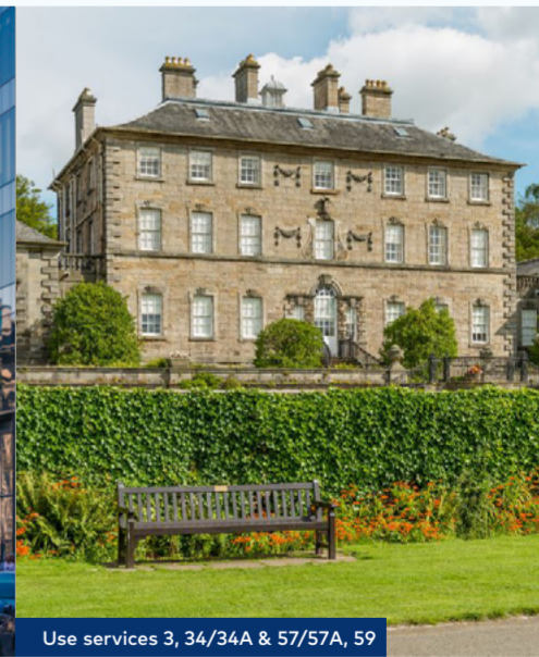
Use services 3, 34/34A & 57/57A, 59

Gallery of Modern Art The Gallery of Modern Art is the main gallery of contemporary art in Glasgow, Scotland. GoMA offers a programme of temporary exhibitions and workshops. GoMA displays work by local and international artists as well as addressing contemporary social issues through its major biannual projects.