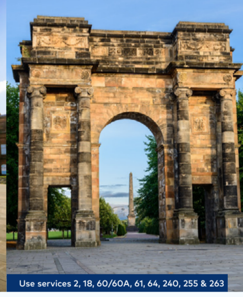
Use services 2, 18, 60/60A, 61, 64, 240, 255 & 263

The People's Palace The People's Palace and Winter Gardens, set in historic Glasgow Green, the oldest public space in the city, tells the story of Glasgow and its people from 1750 to the end of the 20th century. Adjacent to the People's Palace is the extravagant and recently restored Doulton Fountain, unveiled in 1888 to commemorate Queen Victoria's Golden Jubilee.