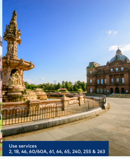
Use services 2, 18, 46, 60/60A, 61, 64, 65, 240, 255 & 263

West Brewery WEST's state of the art Brewery produces award-winning, German-style lagers and wheat beers. Knowledgeable tour guides talk you through the ingredients, the German Purity Law followed and the processes of production. Tours conclude with a tutored tasting session of house lagers and wheat beers.