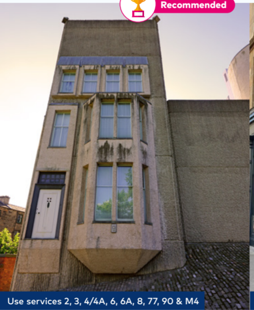
Use services 2, 3, 4/4A, 6, 6A, 8, 77, 90 & M4

Kelvingrove Art Gallery & Museum This is one of Scotland's most popular free attractions and displays an awe inspiring 8000 objects, across some 22 modern galleries. From natural history, to arms and armour, there really is something of interest for everyone here.