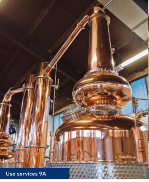
Use services 9A

Hampden Park The Scottish Football Museum at Hampden Park should be on any football fan's itinerary. Home to the world's most impressive national collection of football related objects and memorabilia, you'll be celebrating after your visit, just like scoring a last minute winner!