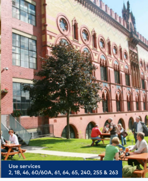
Use services 2, 18, 46, 60/60A, 61, 64, 65, 240, 255 & 263

The University of Glasgow Explore 550 years of history at the University of Glasgow, the fourth-oldest in the English-speaking world. With museums, gift shops, and cafés and restaurants, this is a fascinating look into the history of education.