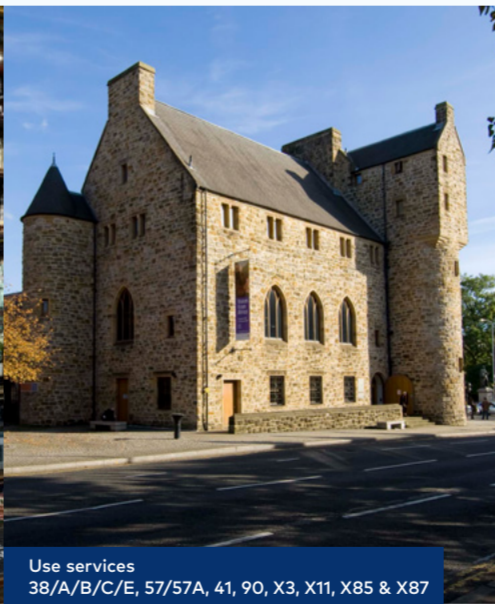
Use services 38/A/B/C/E, 57/57A, 41, 90, X3, X11, X85 & X87

The Pot Still If you want to whet your whistle, The Pot Still is the place for malt whisky in Glasgow. It has over 700 whiskies, some cracking cask ales, real Scottish pies, and friendly staff.